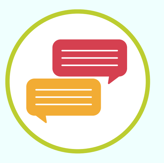
Flexibility & facilities

Achievements & valuesbased contributions are celebrated loudly and proudly.